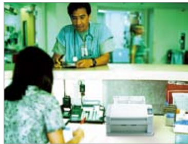
Install in reception areas and other small spaces.

The compact design makes the scanner easy to clean and maintain in any office. And when the long-life rollers need to be replaced, they can be exchanged in seconds. It even has a replaceable lens cover to minimize potential service costs.