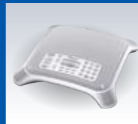
IP Conferencing Phone