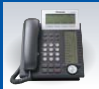
Business Telephone System