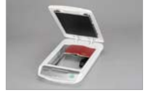
Flatbed scanning (optional).