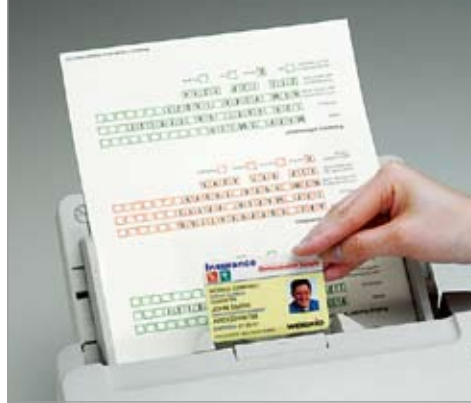
You can scan cards and paper sheets one after the other.

Panasonic document scanners can handle a variety of document types all together, such as cards with irregular surfaces and paper ranging from thin to thick sheets. Driver's licenses, health insurance cards, ID cards and medical records can be scanned one after the other, greatly improving work efficiency. The scanner can also scan data from documents up to 100 inches in length, so you can scan long documents like electrocardiograms. The optional flatbed scanner will scan files and books directly.