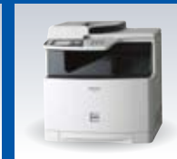
A4 Colour Multifunction