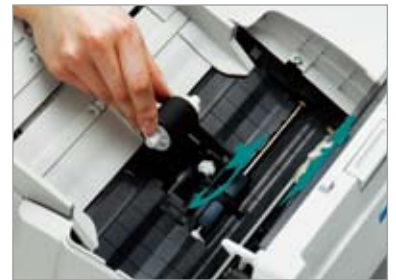
Roller replacement is fast and easy.