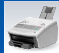
Plain Paper Laser Fax