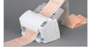
You can also scan electrocardiograms. (The photo shows the KV-S1045C.)